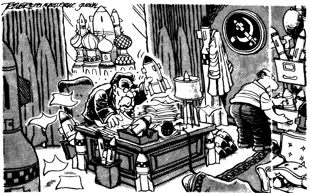
"WHERE'S MY ★#0★! SPEECH BLASTING THE U.S. ARMS BUILDUP?! I KNOW IT'S AROUND HERE SOMEPLACE...!"