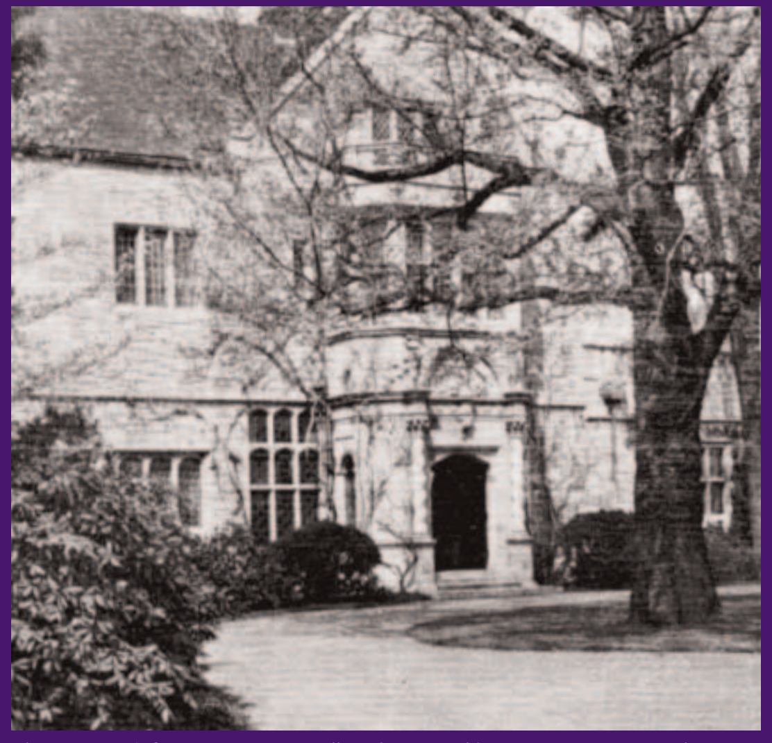
The University's first campus—Coe Hall at Planting Fields in Oyster Bay, New York