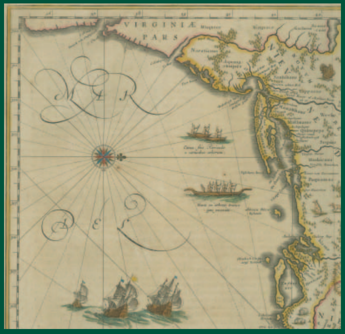
New Belgium and New England by William Janszoon Blaeu (1635)