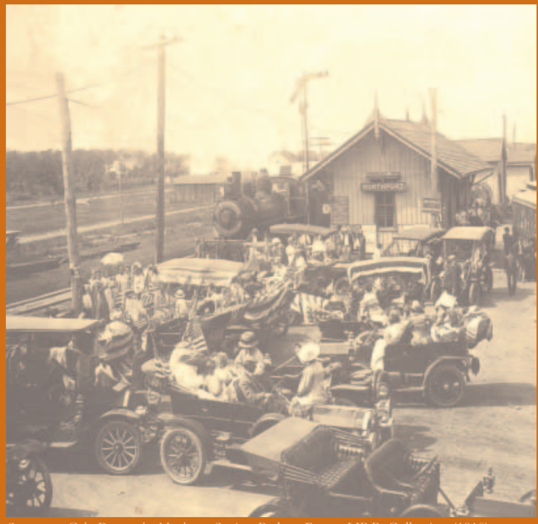
Scene on a Gala Day at the Northport Station, (1910)