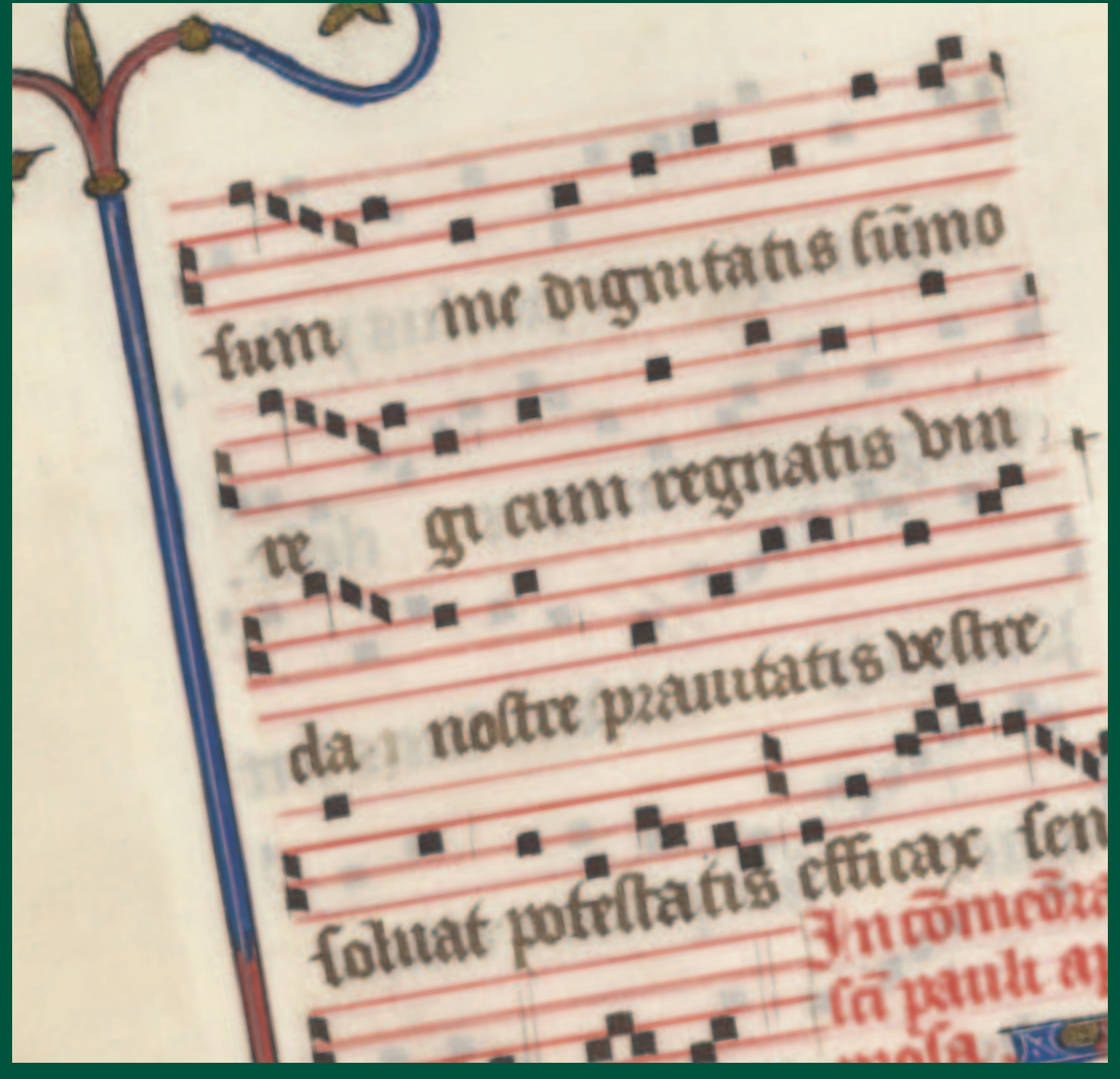
Hymnal, 14th century. Fifty Original Leaves from Medieval Manuscripts, compiled by Otto F. Ege