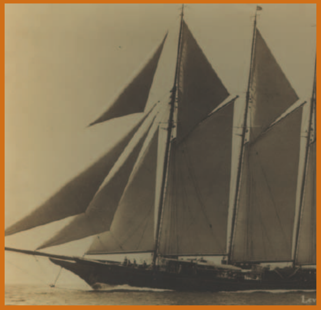
The Migrant Cruise (1933)