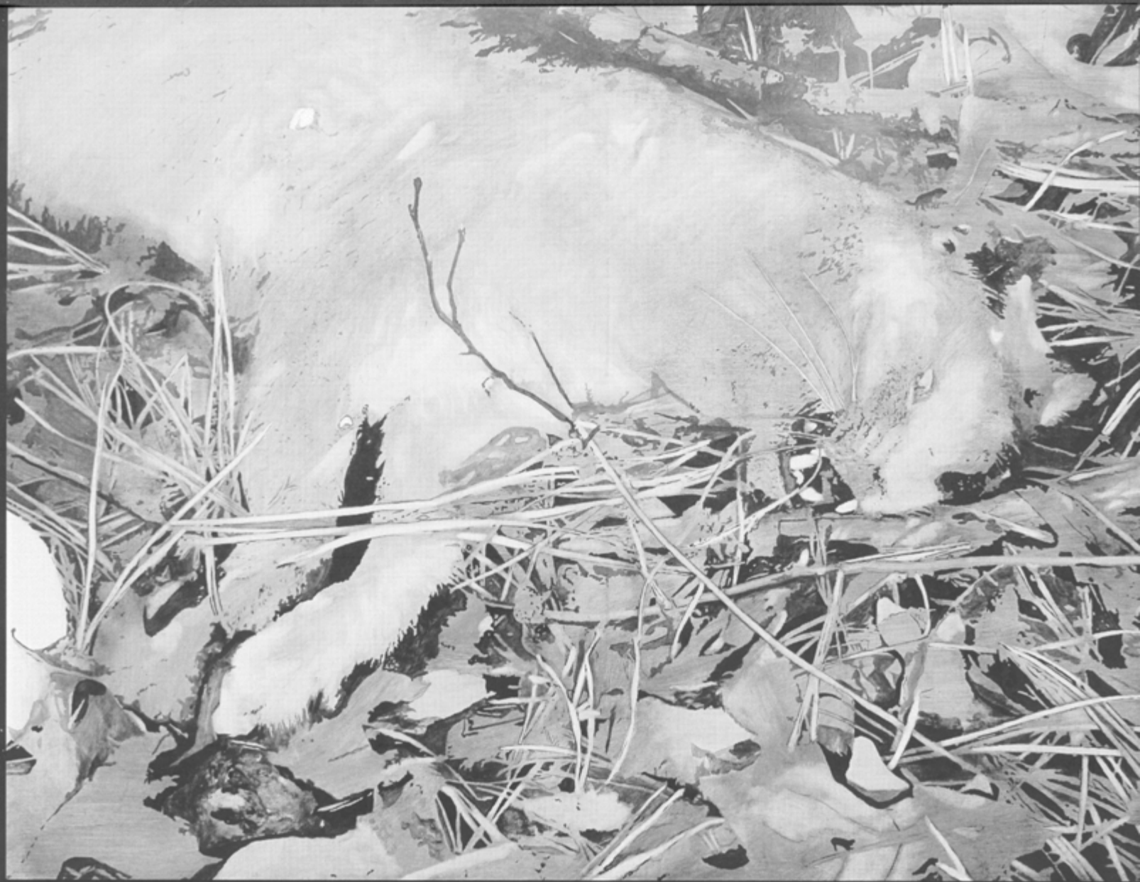
ABOVE EZRA THOMPSON "DEAD CAT" 2013 52 X 67" OIL ON CANVAS