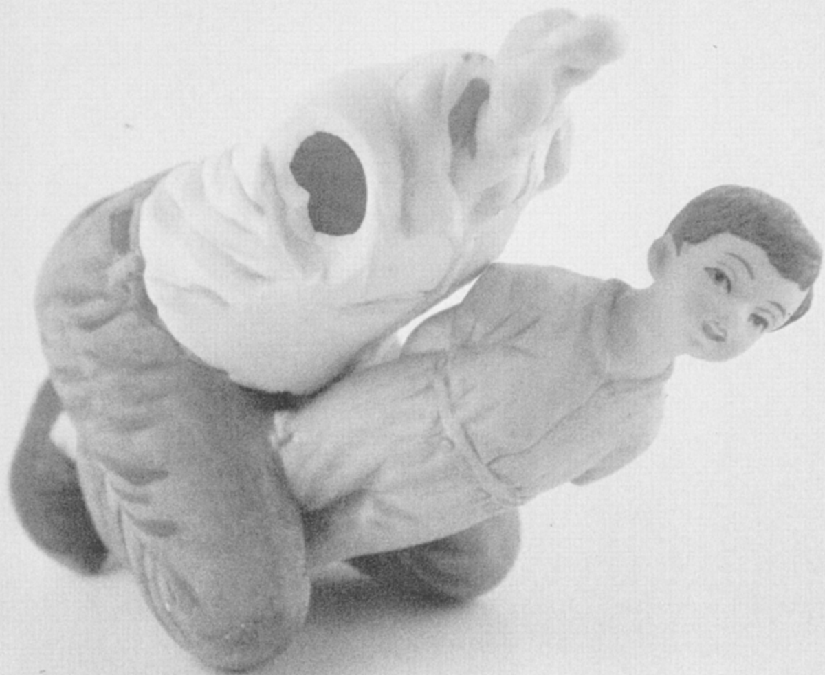
LEFT NICOLE ROBILOTTA "ELEPHANT IS, WAS?" 2012 MELTED GLASS