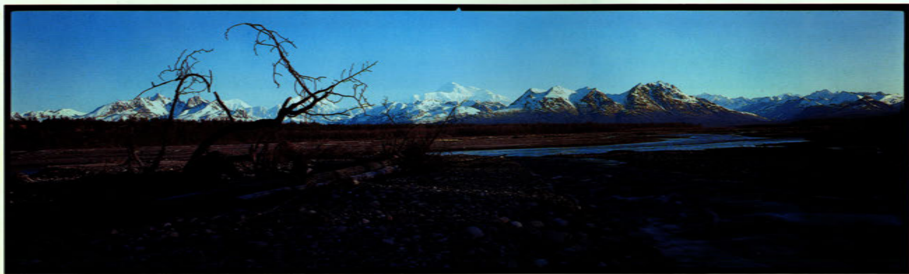
Denali Preserve, Alaska