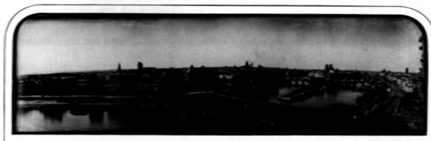
International Museum of Photography, George Eastman House, Rochester, New York.