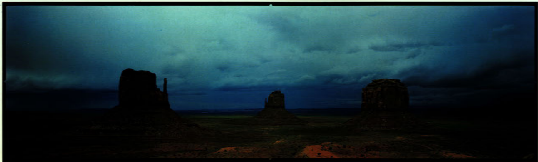
Monument Valley, Utah