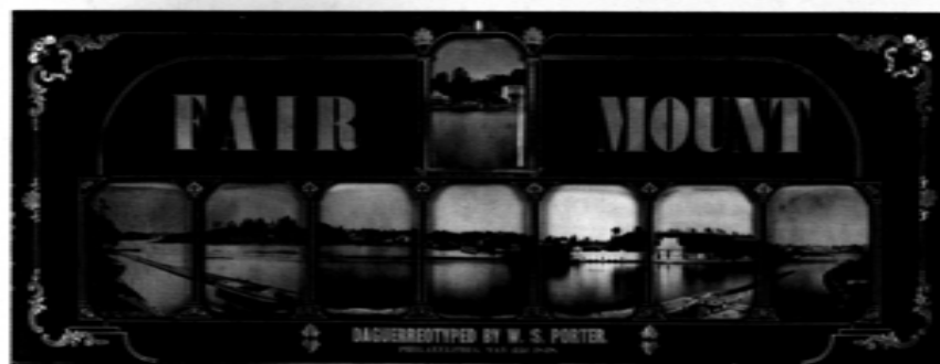
International Museum of Photography, George Eastman House, Rochester, New York.