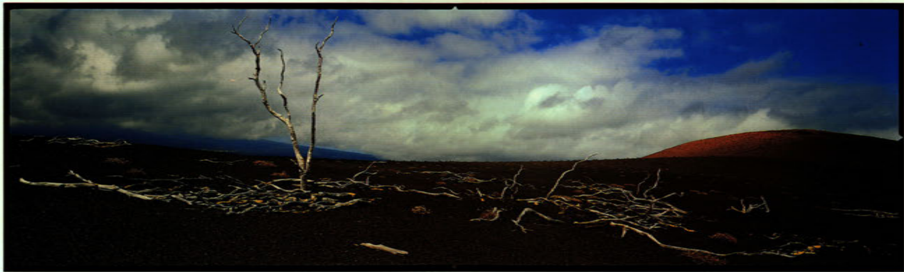
Devastation Trail, Hawaii