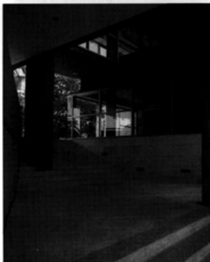
Webb Faculty of Languages Building, Tel-Aviv University, Tel-Aviv, Israel, 1999 Keinan, Piltzer, and Monk Architects