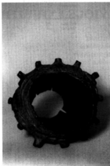
12 Tunnels, 1998 Bronze, 9 x 6 x 4"