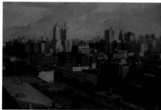
City Blocks , 1999 Oil on linen, 26 x 56"