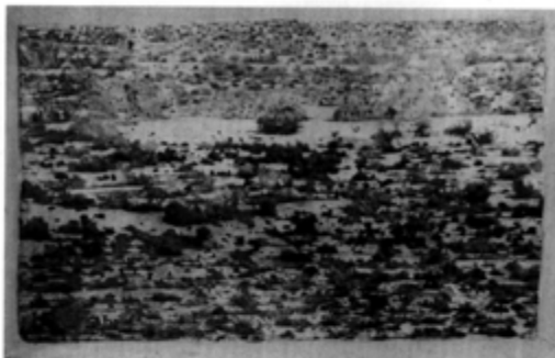
Dry , 1998 Pencil, colored pencil, crayon, and turpentine wash on acrylic ground on unstretched canvas, 122 x 192"