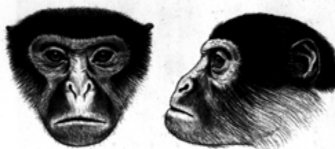
Primate Portraits, 1999 (detail) Colored pencil and ink on paper, 18 x 24"