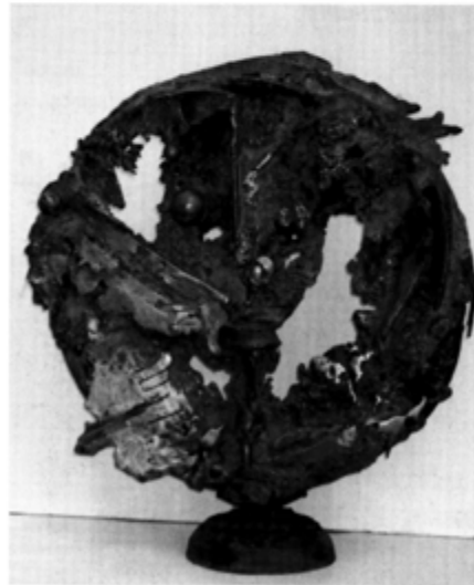
Timer, 1992 Bronze, 27 x 24 x 8"