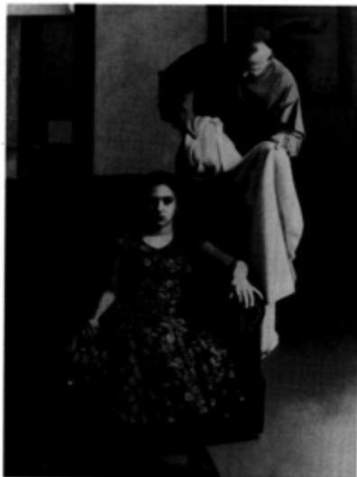
Man with Blanket , 1998 Oil on linen, 72 x 54"