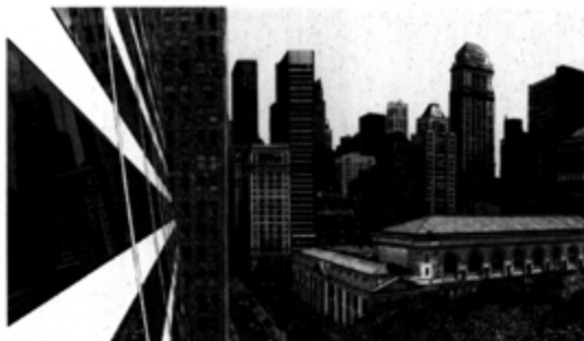
42nd + 5th, 1998 Aquatint and etching, 4 1/2 x 7 1/2"