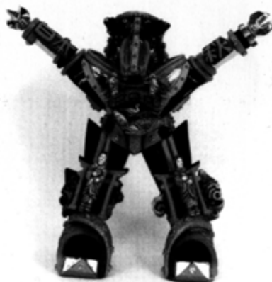
Robot from the Japan Memories Series , 1998 Ceramic with diverse surfaces, 14 1/2 x 15 1/2 x 6 1/2"

Ceramics, Ceramic Sculpture, Drawing, and Painting