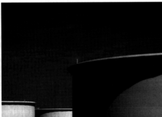
Oil Storage Tanks, Delaware, 1998 Cibachrome, 9 1/8 x 13 1/8"