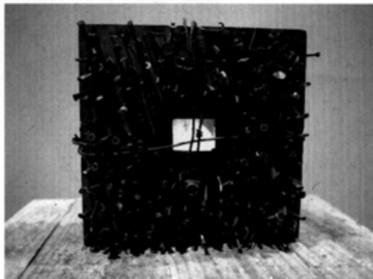
Intertextuality, Vol. I , 1997 Wood, steel, VCR, and monitor, 55 x 20 x 16"