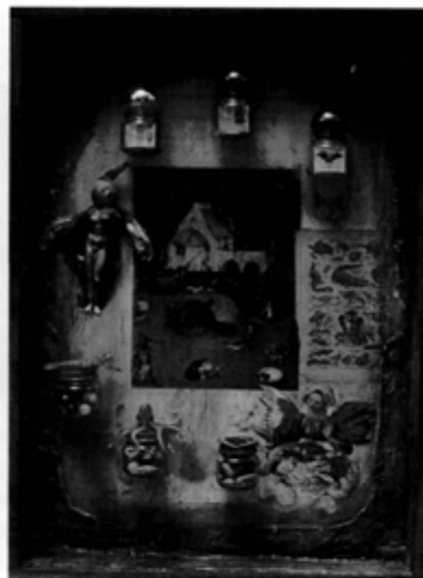
A Frame for St. Anthony, 1999 Boxed collage, 28 x 20"