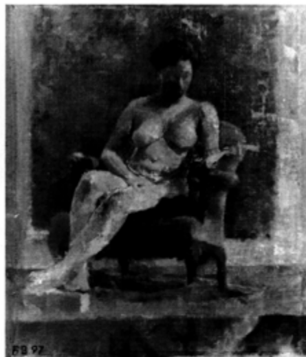
In the Green Chair , 1997 Oil on canvas mounted on board, 13 1/4 x 11 1/4"