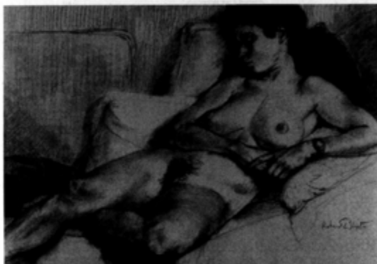
Reclining Nude, 1991 Chalk on paper, 22 1/2 x 31"