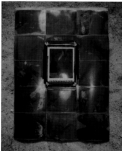
Up and Down, 1999 Polaroid collage on linen, 20 x 13 1/2"