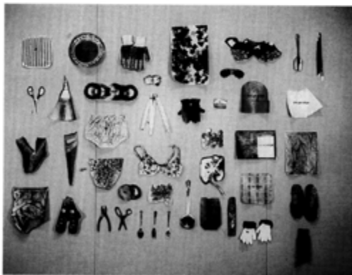
Sweatshop , 1999 Acrylic, polymer photo transfer and vinyl type on canvas, nails, dimensions variable