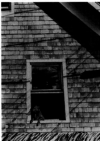
P-Town Musings, Series No.1: When the art of painting is going to the dogs, A shower of golden retrievers (or "How Much Is That Doggy Innuendo?"), 1999 (detail) Watercolor on paper, 34 1/2 x 25 1/2"