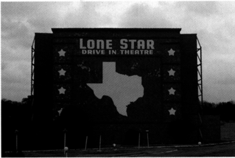
left: Lone Star Drive-in Dallas, Texas 1984, Photograph: Silver halide with Azo dyes