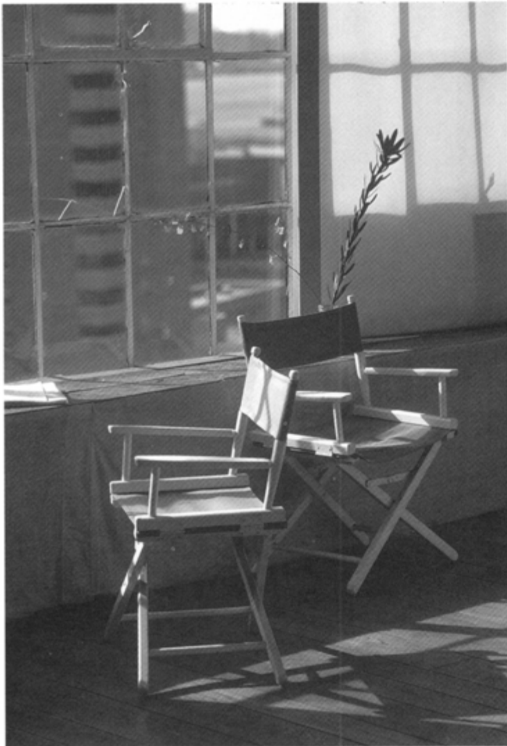
left: Oil and Steel Gallery , Chambers St., N.Y.C., 1985, Photograph: Silver halide with Azo dyes