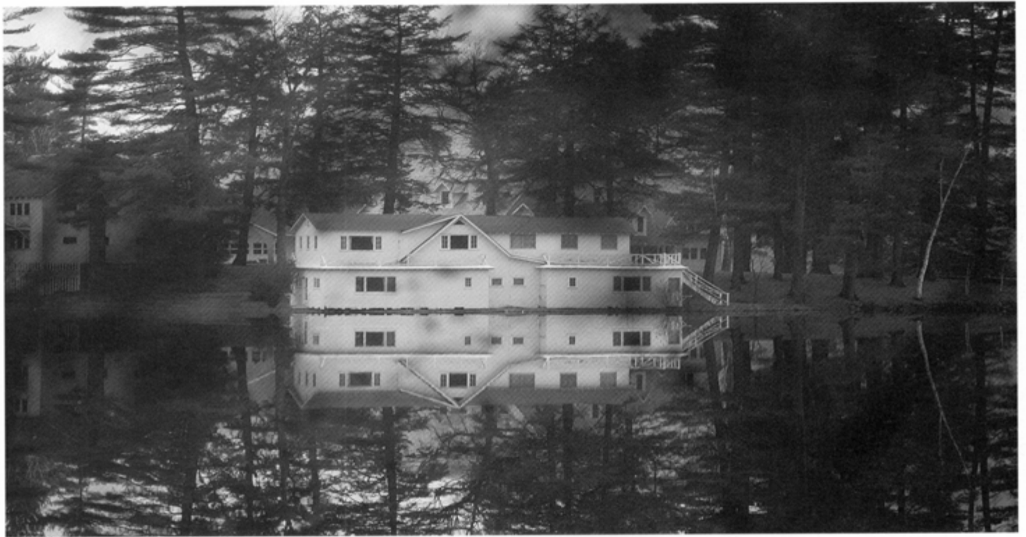
above: Adirondack Lodge , 1991, Photograph: Silver halide with Azo dyes