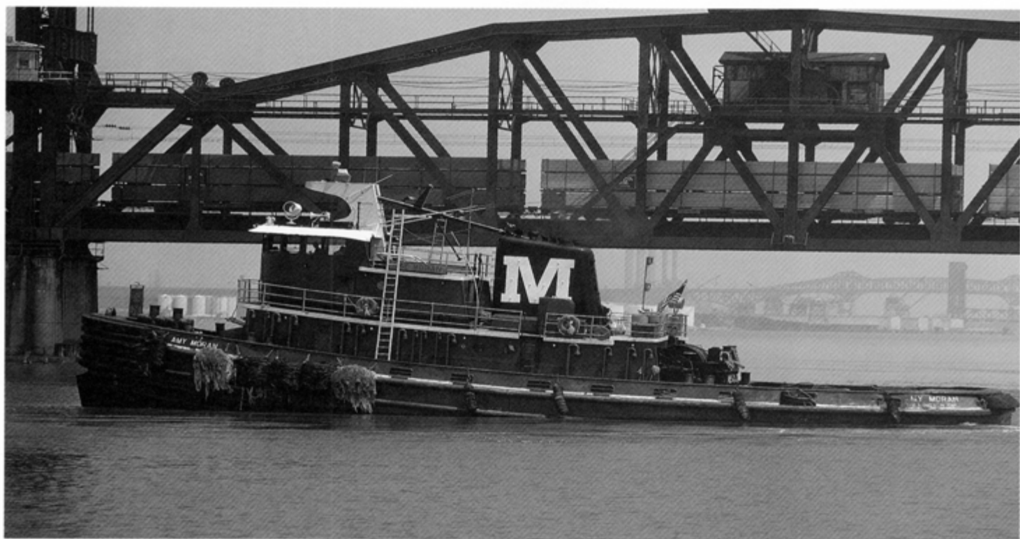
above: The Amy Moran , 1983, Iris Giclée print, Pinnacle Gold inks on Arches CP