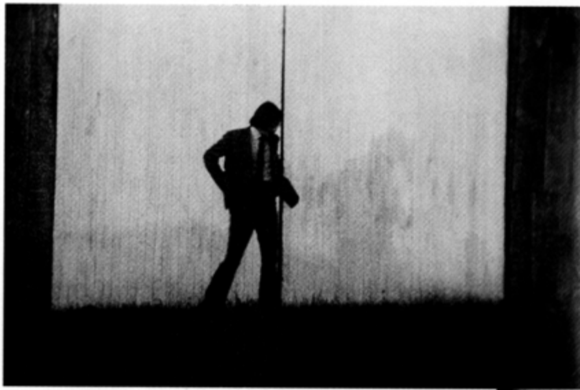
left: The Day , 1969, 16mm B&W film still