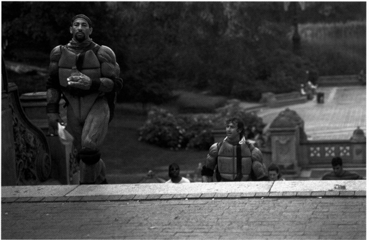
Ninja Turtles in Central Park, N.Y.C., 1994, Photograph: Silver halide with Azo dyes