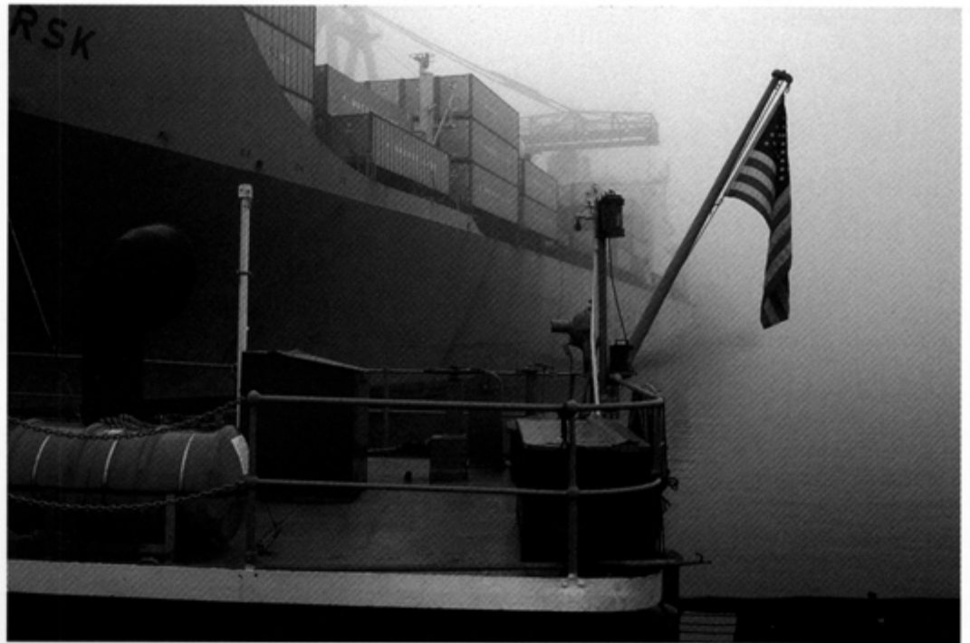
below: Watch Hill, R.I., 2000, Photograph: Silver halide with Azo dyes