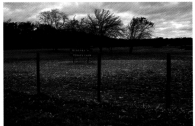
right: The Day After Thanksgiving, 1999, Photograph: Silver halide with Azo dyes

Howardena Pindell is an artist and Professor of Painting and Drawing at Stony Brook. She resides in New York City.