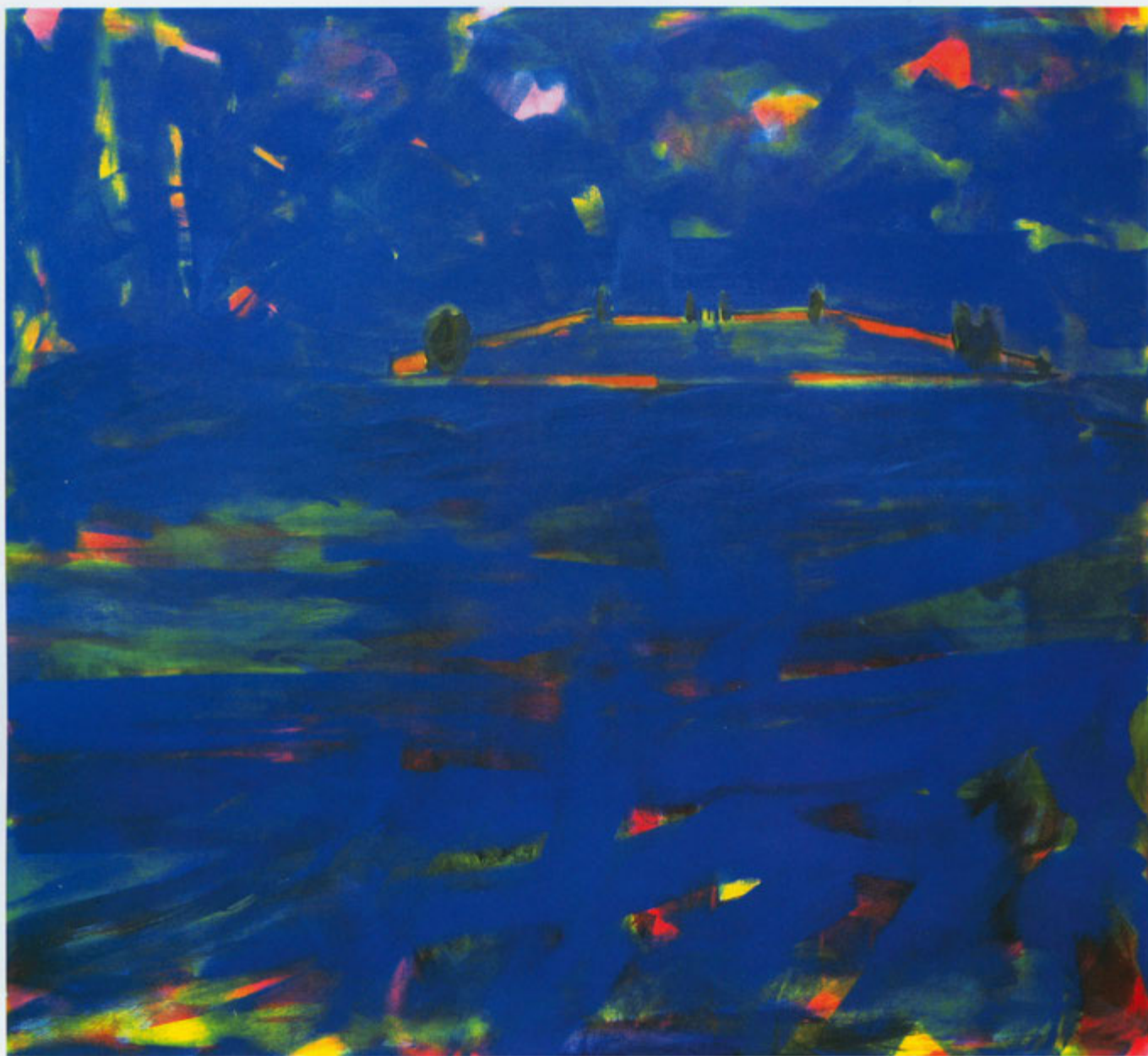
Floating Garden #1 , 1995 Acrylic and oil on linen, 68 x 74 inches