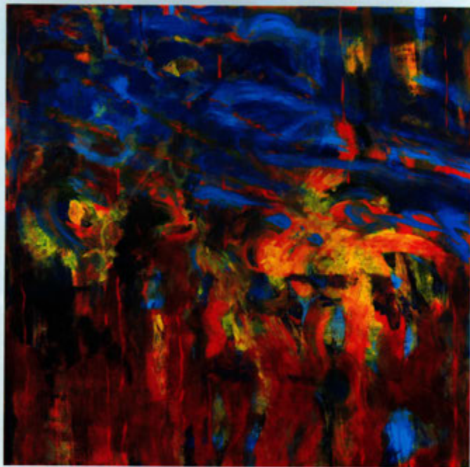
E.L's Gloaming #31 , 2005 Acrylic and oil on linen, 48 x 48 inches