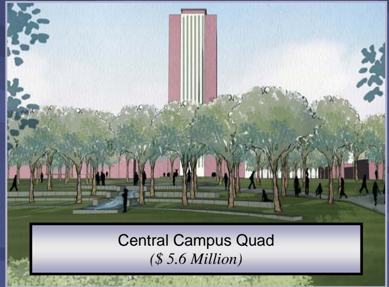
Central Campus Quad ($ 5.6 Million)