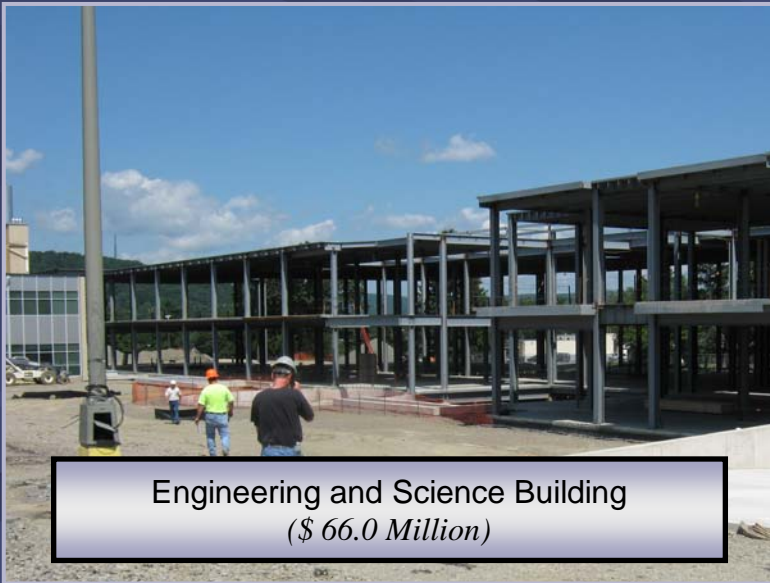
Engineering and Science Building ($ 66.0 Million)