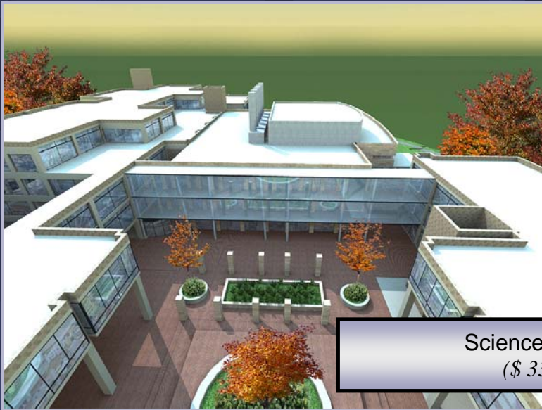
Science III/IV Addition ($ 33.5 Million)