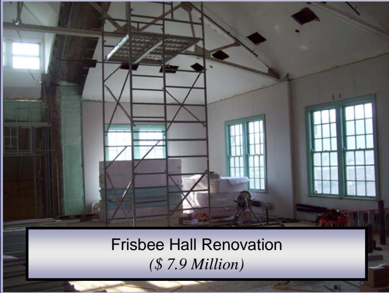
Frisbee Hall Renovation ($ 7.9 Million)