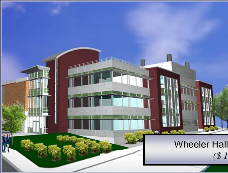
Wheeler Hall Laboratory Addition ($ 13.7 Million)