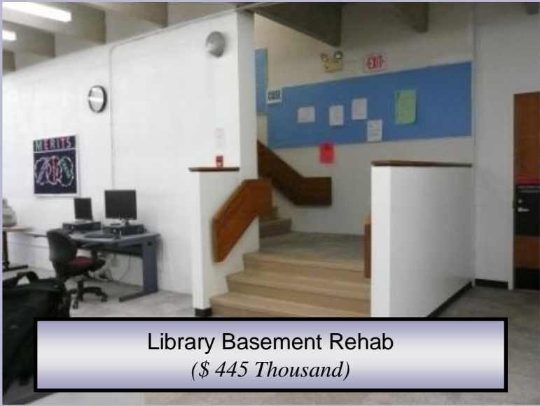
Library Basement Rehab ($ 445 Thousand)