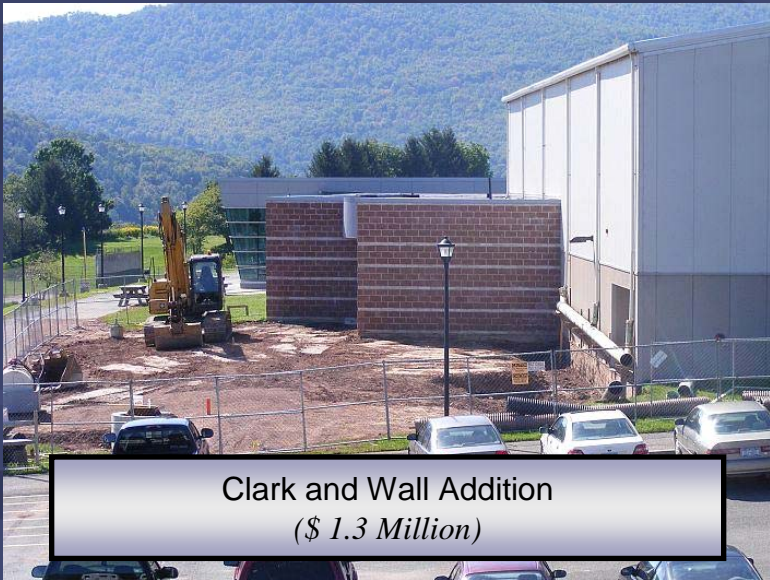
Clark and Wall Addition ($ 1.3 Million)