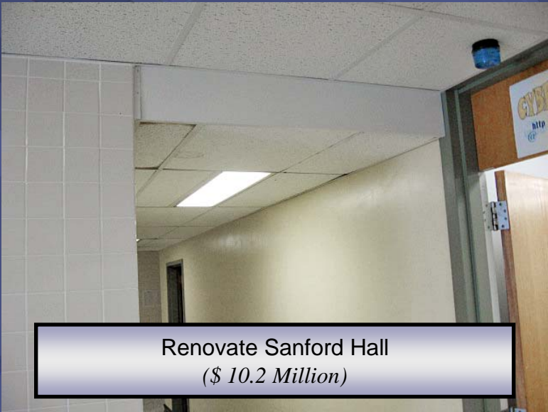
Renovate Sanford Hall ($ 10.2 Million)