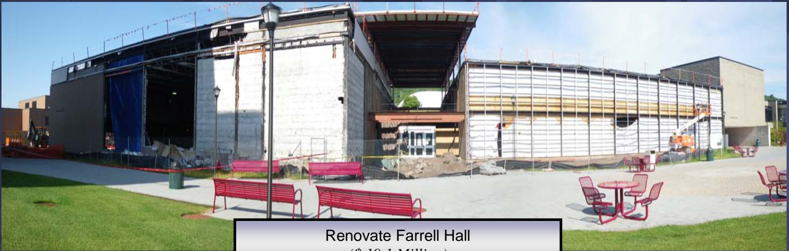
Renovate Farrell Hall ($ 19.1 Million)