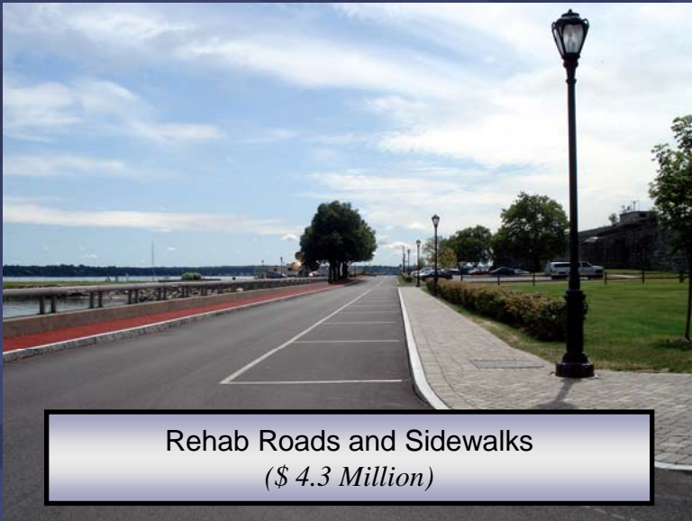
Rehab Roads and Sidewalks ($ 4.3 Million)