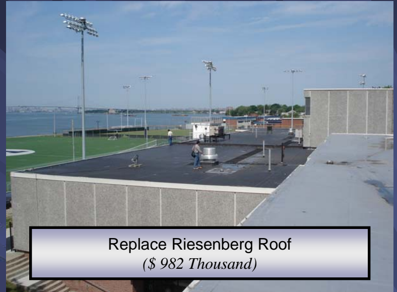
Replace Riesenberg Roof ($ 982 Thousand)