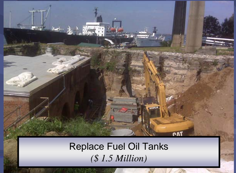
Replace Fuel Oil Tanks ($ 1.5 Million)