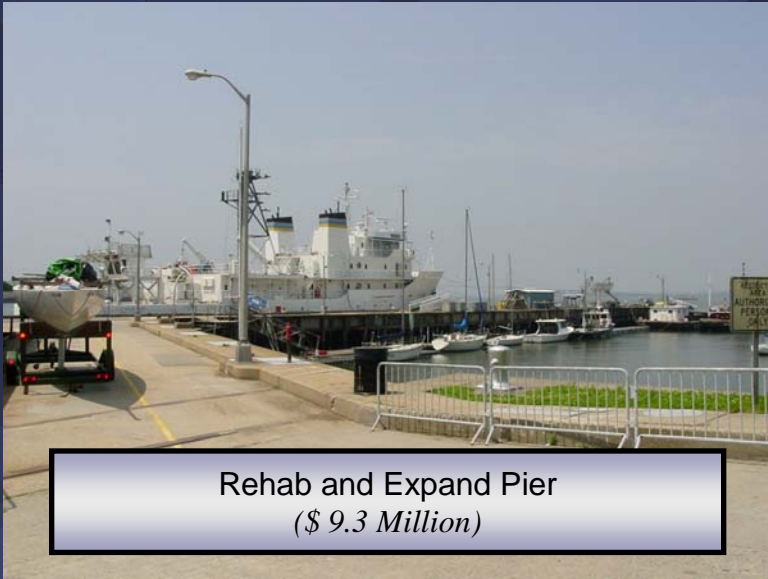
Rehab and Expand Pier ($ 9.3 Million)