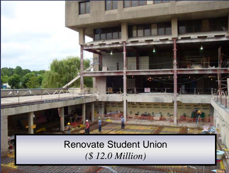
Renovate Student Union ($ 12.0 Million)