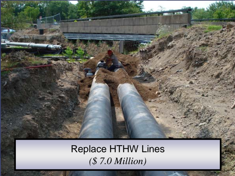
Replace HTHW Lines ($ 7.0 Million)