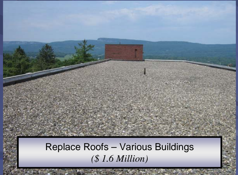
Replace Roofs – Various Buildings ($ 1.6 Million)