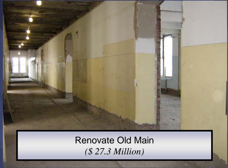
Renovate Old Main ($ 27.3 Million)