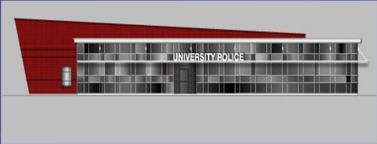
Reconstruct Bldg 47 – University Police ($ 4.0 Million)