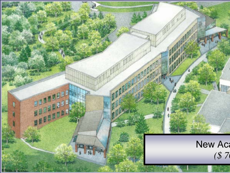
New Academic Building ($ 70.6 Million)