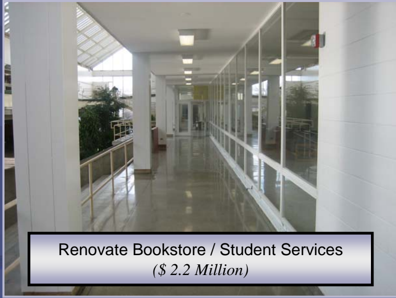
Renovate Bookstore / Student Services ($ 2.2 Million)