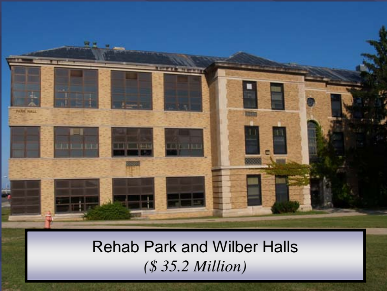
Rehab Park and Wilber Halls ( $ 35.2 Million )