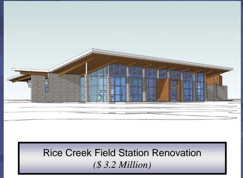
Rice Creek Field Station Renovation ( $ 3.2 Million )