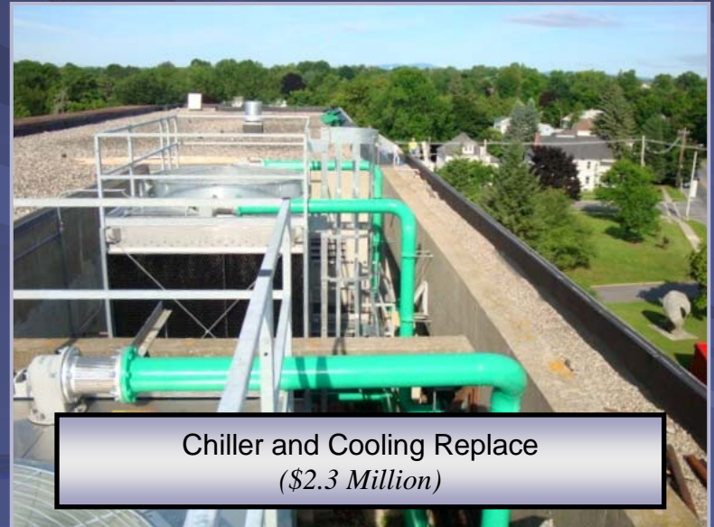
Chiller and Cooling Replace ($2.3 Million)