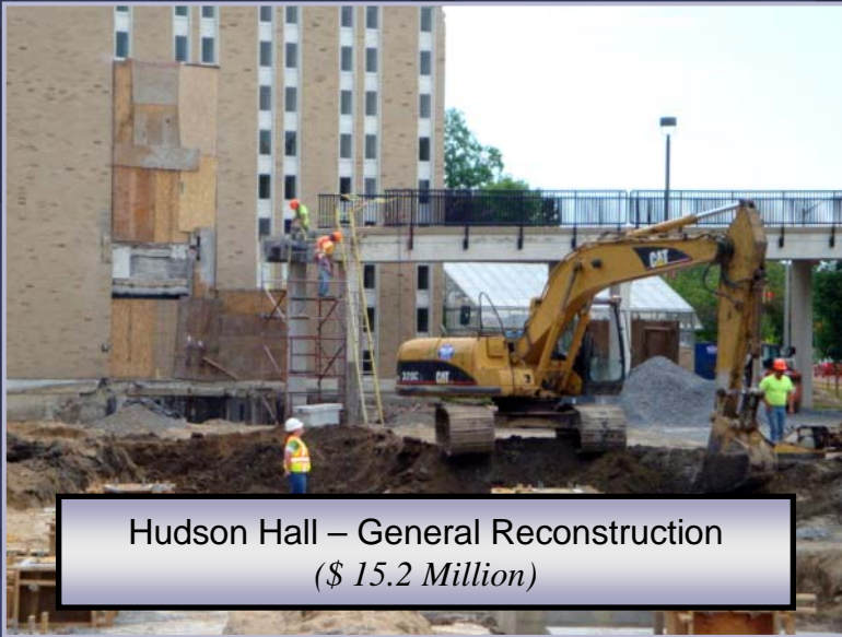
Hudson Hall – General Reconstruction ($ 15.2 Million)