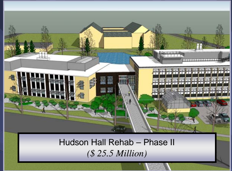
Hudson Hall Rehab – Phase II ($ 25.5 Million)