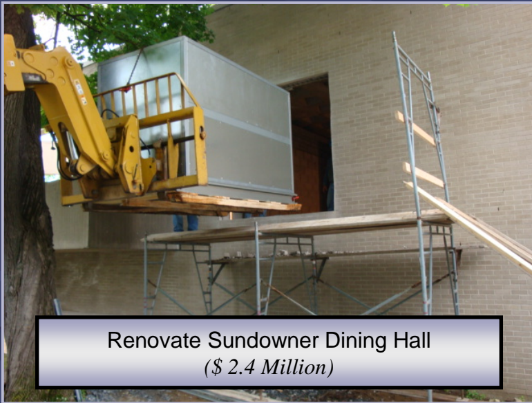
Renovate Sundowner Dining Hall ($ 2.4 Million)