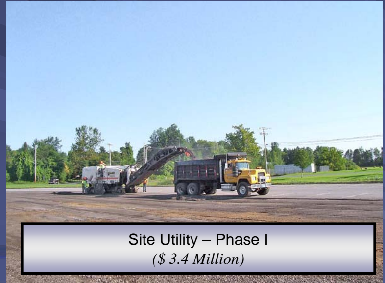
Site Utility – Phase I ($ 3.4 Million)