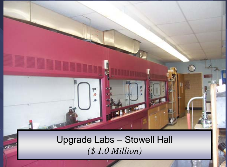
Upgrade Labs – Stowell Hall ($ 1.0 Million)