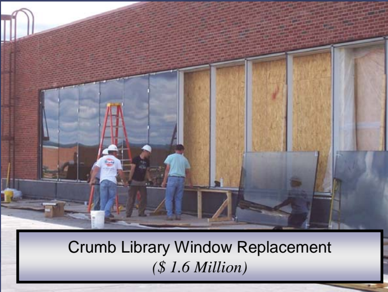
Crumb Library Window Replacement ($ 1.6 Million)