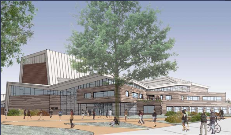
Performing Arts Building ($ 52.9 Million)