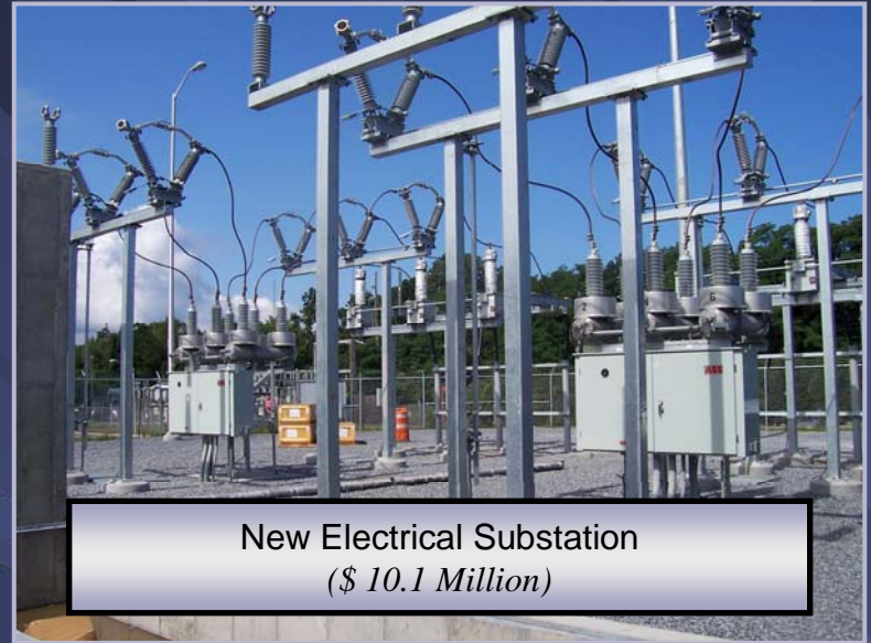
New Electrical Substation ($ 10.1 Million)