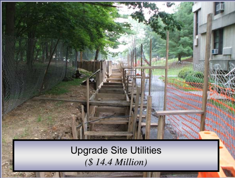
Upgrade Site Utilities ($ 14.4 Million)