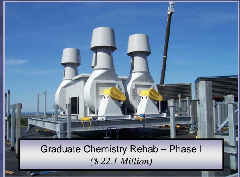
Graduate Chemistry Rehab – Phase I ($ 22.1 Million)