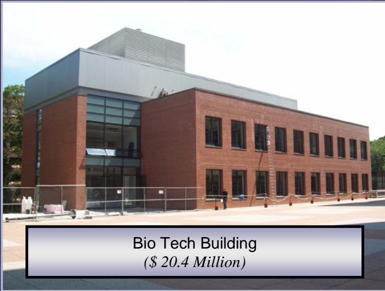
Bio Tech Building ($ 20.4 Million)