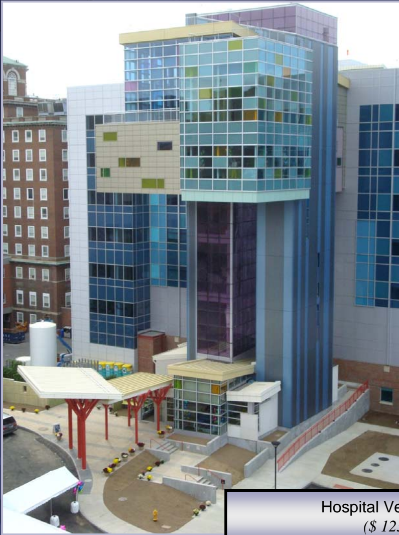
Hospital Vertical Expansion ($ 123.2 Million)