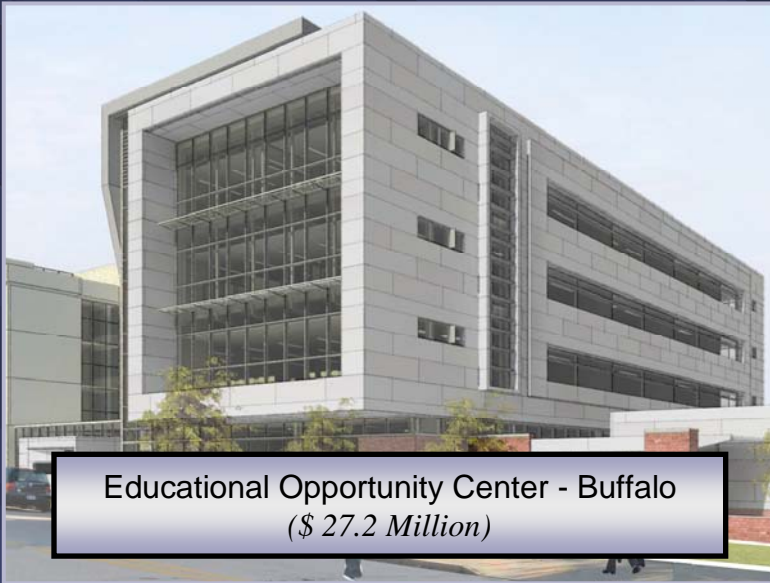
Educational Opportunity Center - Buffalo ($ 27.2 Million)