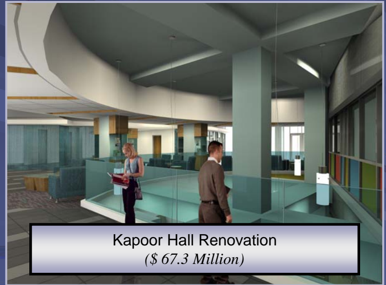
Kapoor Hall Renovation ($ 67.3 Million)