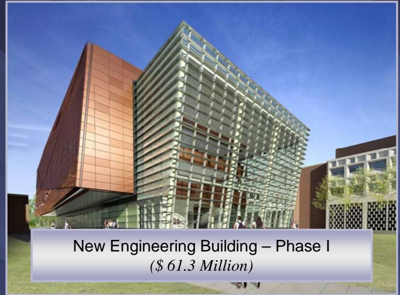
New Engineering Building – Phase I ($ 61.3 Million)