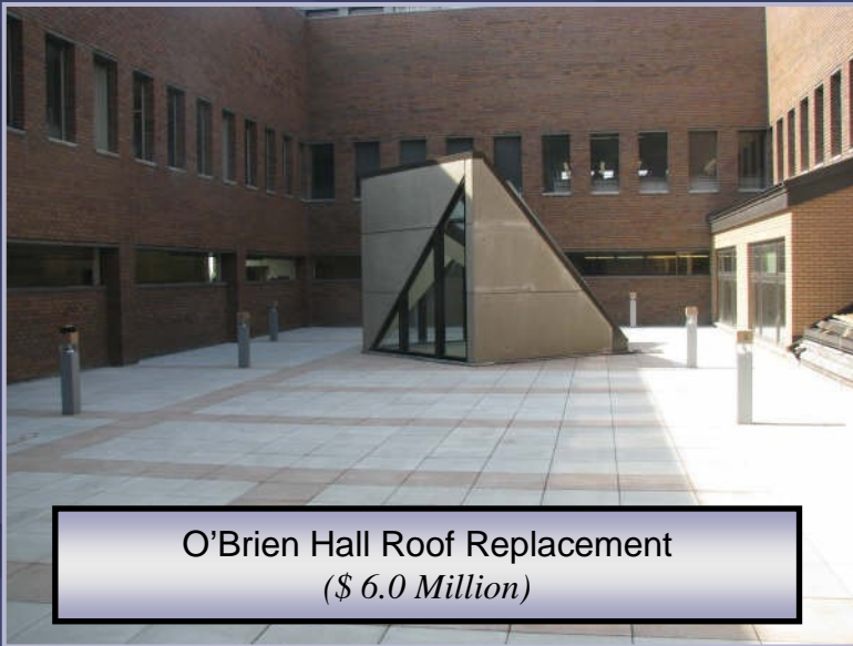
O'Brien Hall Roof Replacement ($ 6.0 Million)