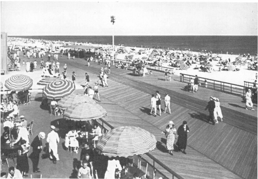
Jones Beach, Boardwalk at Central Mall, 5 August 1934.

At first, automobiles were the only means of accessing Jones Beach, but after the LISPC came under attack for this policy of restricted access, bus stop facilities were added by 1931. Although it has often been contended that the overpasses on roads to Jones Beach were deliberately built too low for