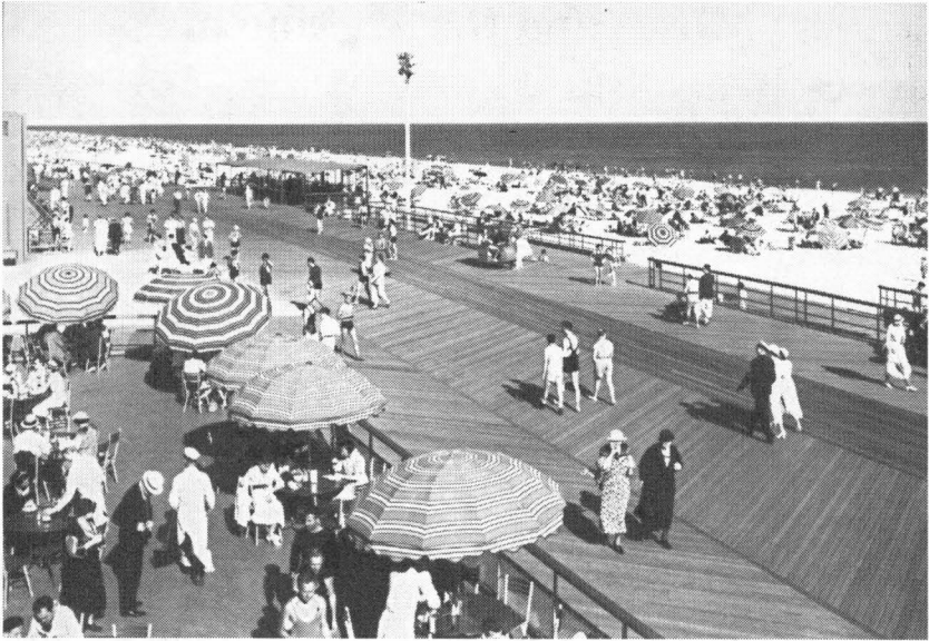
Jones Beach, Mall Area, 6 September 1938.