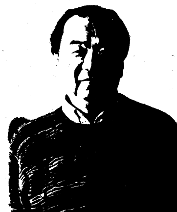
A LECTURE BY