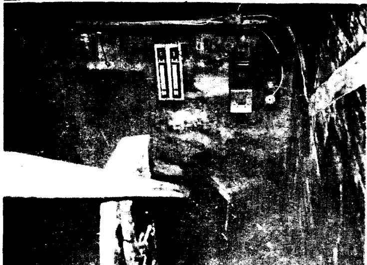
Above is a view of the burned-out cellar of the main greenhouse next to Coe Hall. The charred walls and littered floor are visible in this photo, which was taken from the top of the stairwell.