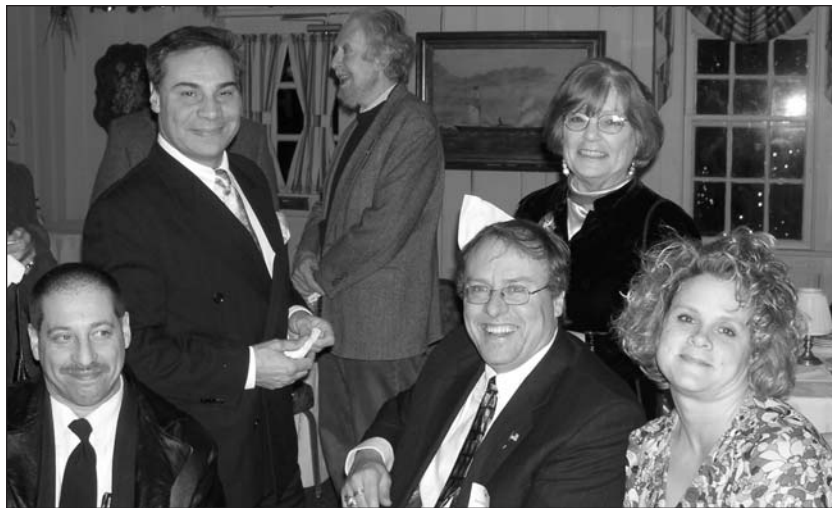
Continued on page 3