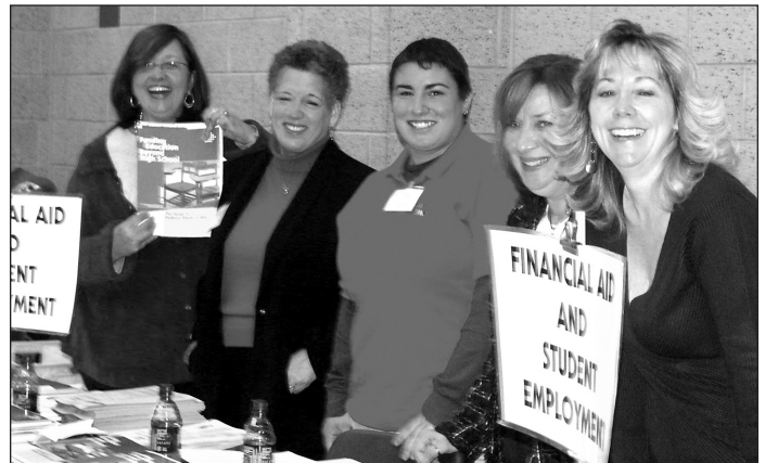
Financial Aid and Student Employment