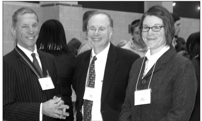
School of Business