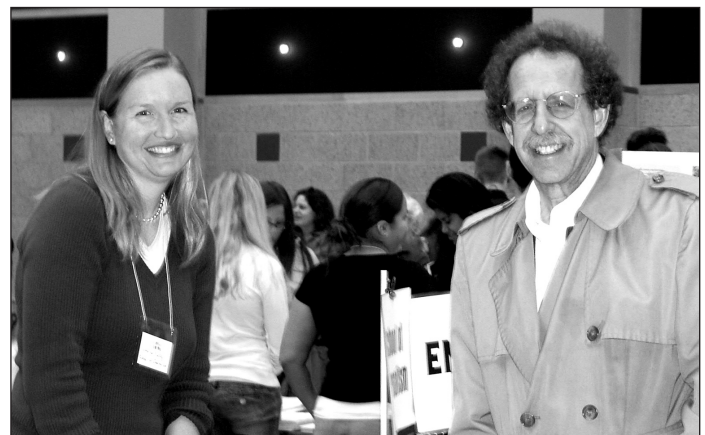
School of Journalism