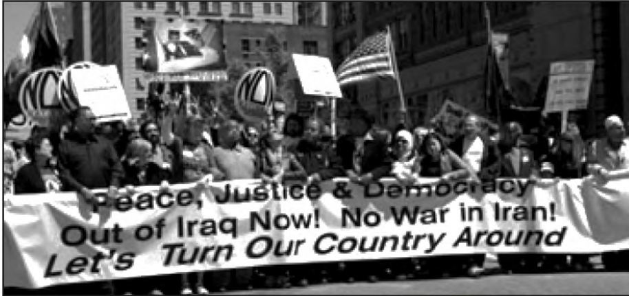
Rev. Jesse Jackson, Al Sharpton and Susan Sarandon help lead the march.