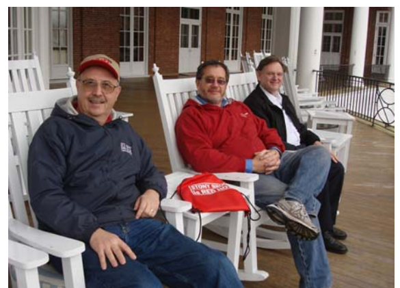
at the President/Vice President meeting, Otesaga Hotel, Cooperstown, NY.