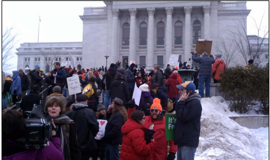
Crowd outside the Capitol that gather to greet the people exiting the building. after the Sunday deadline.

I was fortunate enough to be able to attend the protests on February 26, 27, and 28 in Wisconsin against the anti-labor and anti-public employee legislation. The first day I was in Madison was an amazing experience. The estimate crowd was at about 100,000. The demonstration was both around the Capitol Building as well as inside. The crowd included a broad cross section of people from around the state of Wisconsin. The energy of the crowd was electrifying. I spent some of my time handing out buttons and signs and the rest of the time marching and chanting.