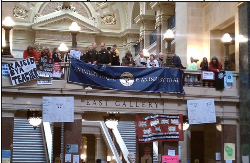
Inside the Capitol during the protests on Sunday, February 27, 2011.

What can you do? Check the AFL-CIO website, the AFL-CIO blog, participate in local rallies, and donate to the cause when asked. This is very much our fight and we need to support all of the public employees throughout the nation.