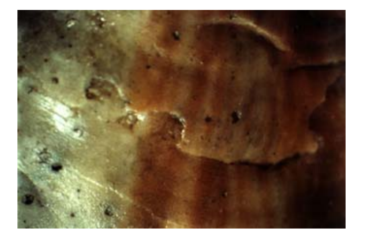
Figure 3. Growth line along color-band shift showing jagged indentations indicative of damage during growth along the valve margin. (Click on thumbnail for larger image.)