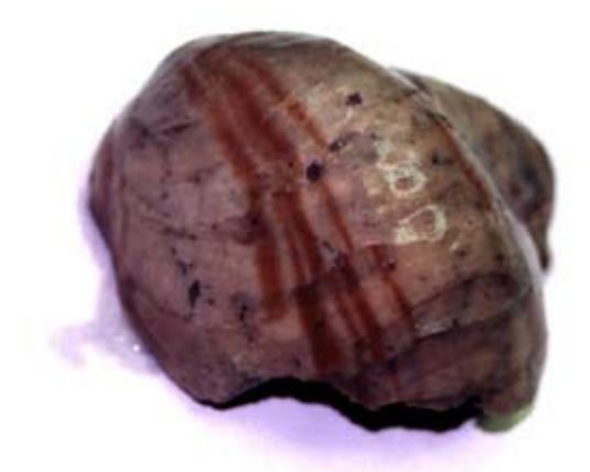
Figure 1. Left valve of Pycnodonte convexa showing color bands extending from umbo at top left to plane of commissure at bottom. Three distinct lines of color-band offset are apparent. (Click on thumbnail for larger image.)

Color-band offsets do not appear to be a diagenetic feature. There is no evidence of disruption or damage on the valve interior, nor are any of the valves crushed or damaged as a result of shell dissolution. Apparently, the offsets were generated by repeated disruptions of the valve margin during growth. My working hypothesis is that the color-band offsets record unsuccessful predation attempts resulting in damage to the shell margin along the plane of commissure. Injury to the mantle tissue along the plane of commissure or extreme withdrawal of the mantle away from the commissural shelf could have resulted in a repositioning of the regions of the mantle secreting pigmented shell. If so, then band offsets provide a new metric for assessing the intensity of durophagous predation on Pycnodonte .