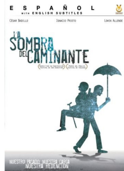
La sombra del caminante (2004) Dir. Ciro Guerra Wednesday November 2nd 6:30pm-8:30pm

This road trip movie shows Malú and Jorgito trying to overcome the social and political differences lived by families in Cuba