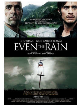
También la lluvia/Even the rain (2010) Dir. Icíar Bollaín Friday November 4th 1:30pm-3:30pm

In this Italian-Brasilian coproduction, Guarani indians decide to fight for their ancestors' land, while trying to adapt to the demands of globalization