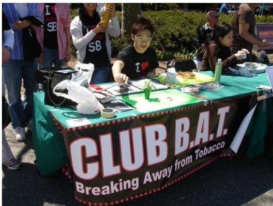
A member of the new club, Breaking Away from Tobacco (BAT), raises awareness about the toxic chemicals in cigarettes at Stony Brook’s Earthstock.