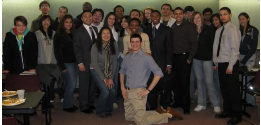
Society of Hispanic Professional Engineers (SHPE), Stony Brook Chapter.