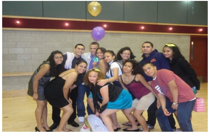
LASO members at one of their many events.