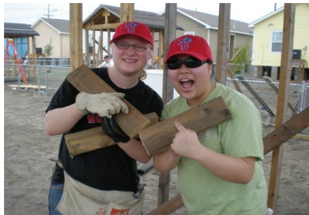
Two members of a previous Alternative Spring Break Outreach (ASBO) trip having some fun while building homes for Hurricane Katrina victims.