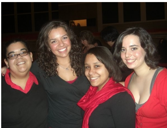
Student actors in Stony Brook’s latest production of The Vagina Monologues.