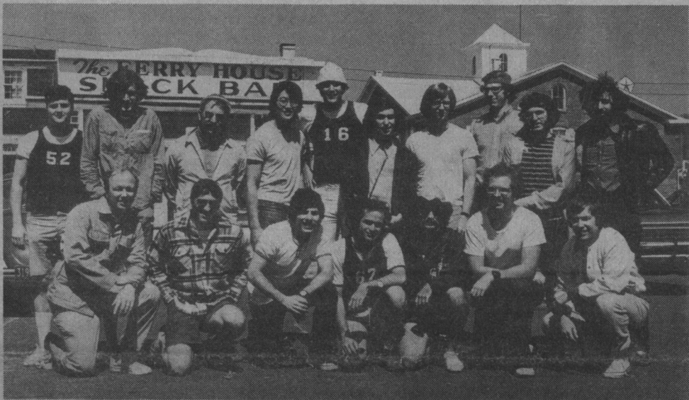
A group of alumni participated in an alumni race May 6 preceding the first annual Long Island Sound Intercollegiate Rowing Championship.

PARENTS: WE NEED YOUR SON/DAUGHTER'S CURRENT ADDRESS. (See Parents' Coupon, page 4)