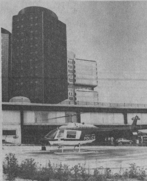
FAA-approved heliport, 100 feet away from the University Hospital's Emergency Room entrance, makes possible the rapid, traffic-free transit so often needed in critical medical cases requiring immediate, specialized care.