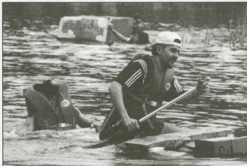
Who's got the duct tape? Students, faculty, alumni, and staff race cardboard and tape boats in the 9th Annual Roth Pond Regatta, May 2 at 3 p.m.