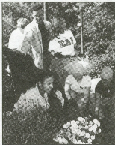
Volunteers keep campus green at the 10th Annual Pride Patrol, April 24.

The Green Team Program is a partnership of faculty, students, and staff who are also dedicated to beautifying the campus landscape. Green Teams create small gardens that are part of a long-term beautification program. Since both programs share the same goals, it seemed natural to link the two programs for this day. This year volunteers can either establish a new Green Team and select a site or sign up for Pride Patrol and work for a couple of hours at one of the existing Green Team sites. For more information, call the Office of Conferences and Special Events, 632-6320.