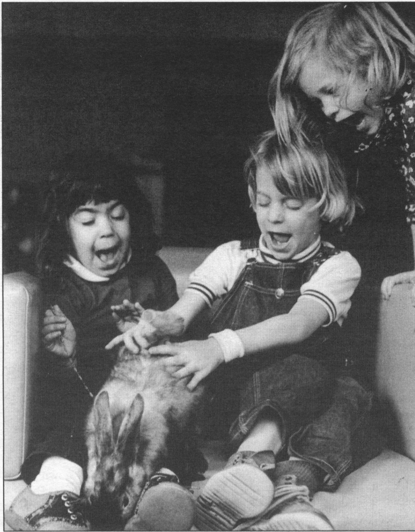
The Fourth Annual Child Care Cash Bonanza takes place April 30 in the Student Activities Center. Proceeds benefit Stony Brook's campus child-care center.