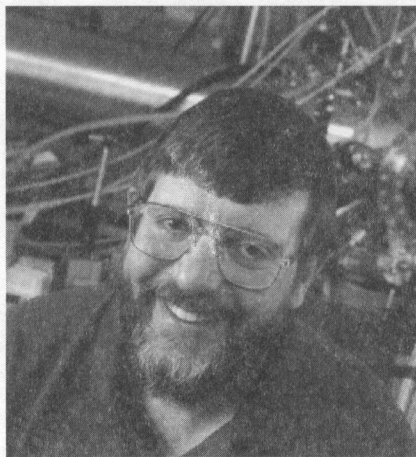
Dr. Phillips in his lab.

Dr. Phillips, adjunct professor of physics at the University of Maryland, College Park, is a fellow of the National Institute of Standards and Testing (NIST). He is the leader of the Laser Cooling and Trapping Group in the Atomic Physics Division of NIST's Physics laboratory. In addition to the Nobel Prize, he is the recipient of the Gold Medal of the U.S. Department of Commerce.