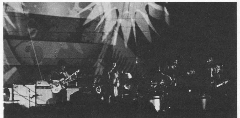
JEFFERSON AIRPLANE performed May 1 at an outdoor rock concert and light show presented free by the Student Activities Board for thousands of students and townspeople.