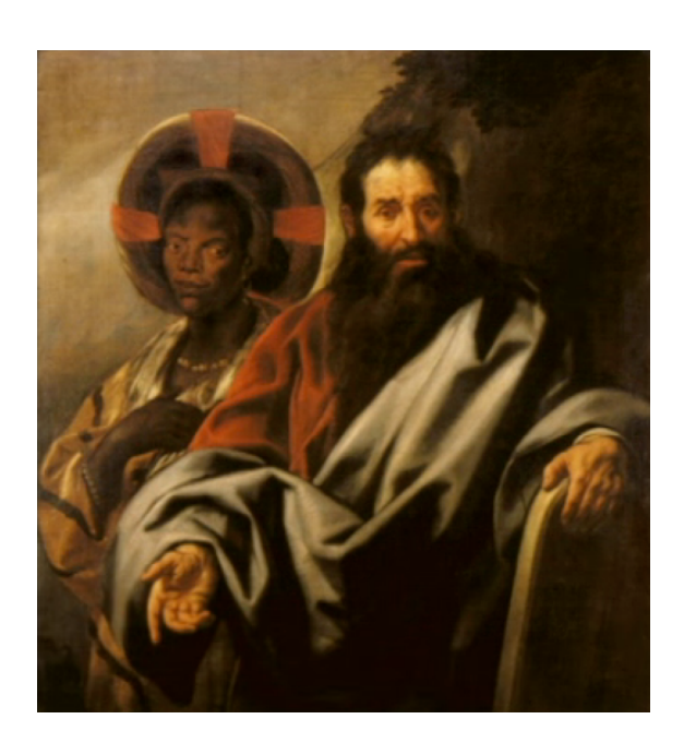
Fig. 4. Jacob Jordaens, Moses and his Ethiopian Wife ,1650. Rubenshuis, Antwerp.