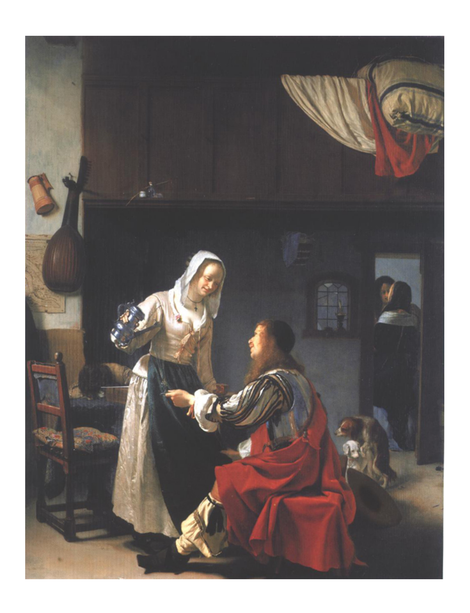
Fig. 3. Frans van Mieris (the elder), Inn Scene , 1658, oil on wood, 42.8 x 33.3 cm, Mauritshuis , Den Haag.