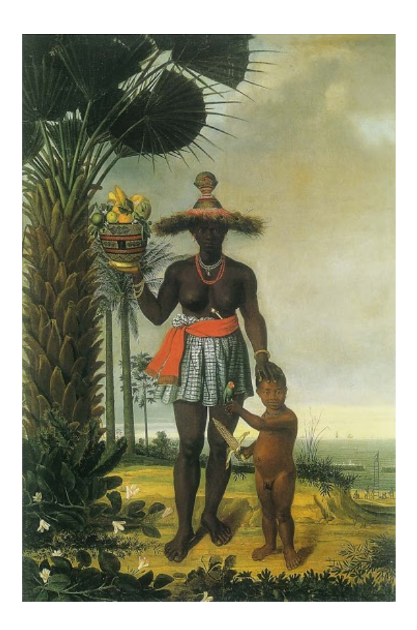
Fig. 5. Albert Eckhout, Negra ,1641. National Museum Denmark, Copenhagen.