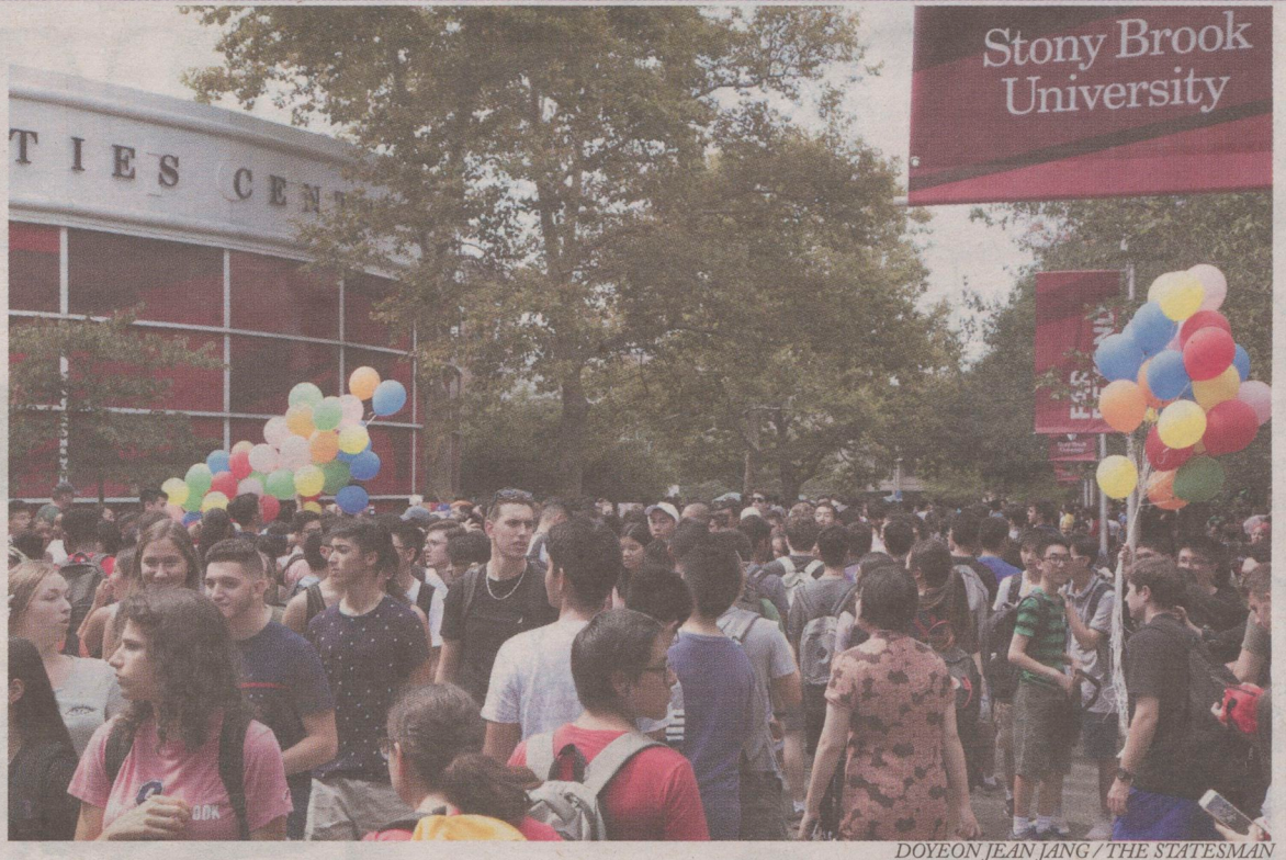
Students shop for clubs on the Academic Mall at Stony Brook University's Involvement Fair on Wednesday, Sept. 5. A second Involvement Fair is on Sept. 12.

According to the suit, both plaintiffs were unaware of Diguo's illegal tactics.