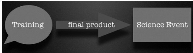
Figure 1. The result of training scientists: Can these talks directly interface to a science event?

Sweden, Norway, Denmark, South Africa, and Japan. Along with teaching, we collaborated with communication faculties across the US to research how experts learn to communicate complex information to general audiences. The following sections briefly outline what we teach in our basic workshops, along with providing some practical advice on lessons learned.