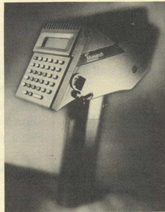
Monarch® Pathfinder® Ultra™

This new product scans, prints and applies the new label using one hand-held unit without the burden of cables. Monarch engineers did a comparison study and found the unit to be 89% faster than performing re-labeling functions by conventional methods.