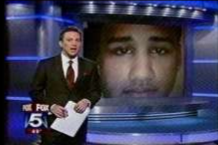
A Hit and Run Accident