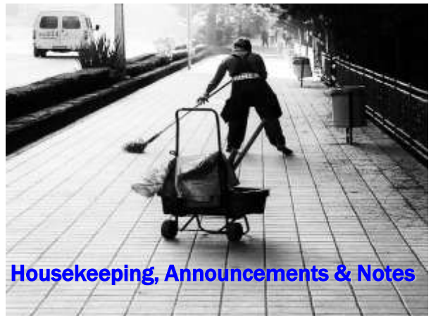
Housekeeping, Announcements & Notes

These skills relate to course outcomes 1, 2 & 4