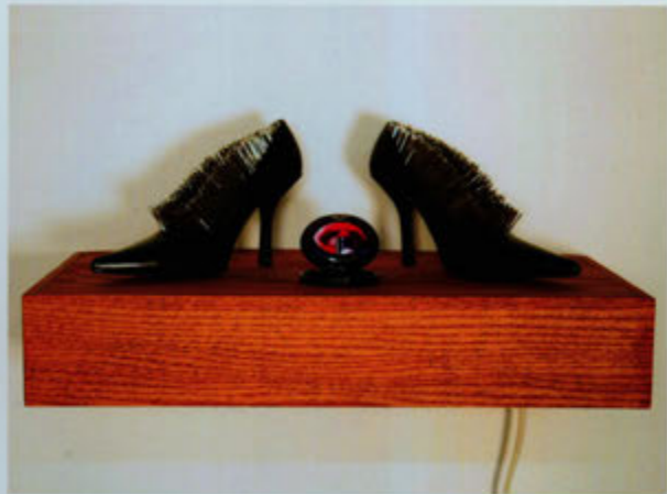
REplay Series: Femme , 2005–2006 Video sculpture

Associate Professor; Director of the Consortium for Digital Arts, Culture, and Technology Physical Computing Installation, Digital Media, and Video