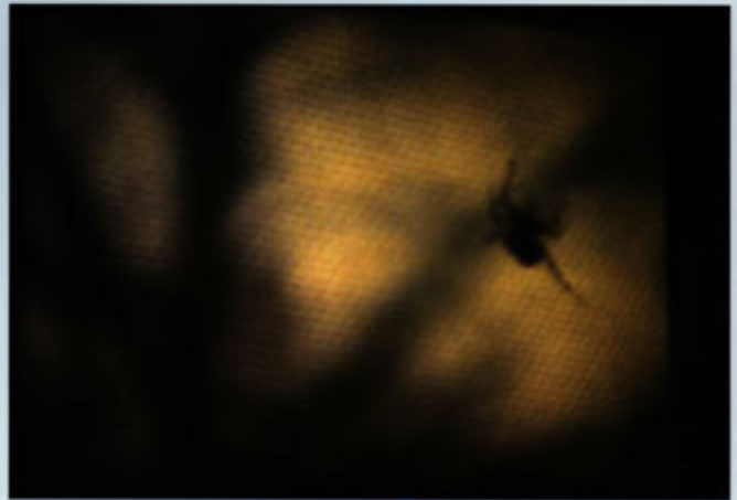
Captives , 2010 Digital video, 9:00 minutes