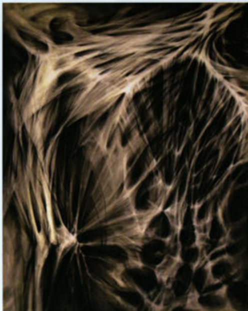
Dorsal Cleft, 2009 Charcoal and watercolor on paper, 54½ x 42½"