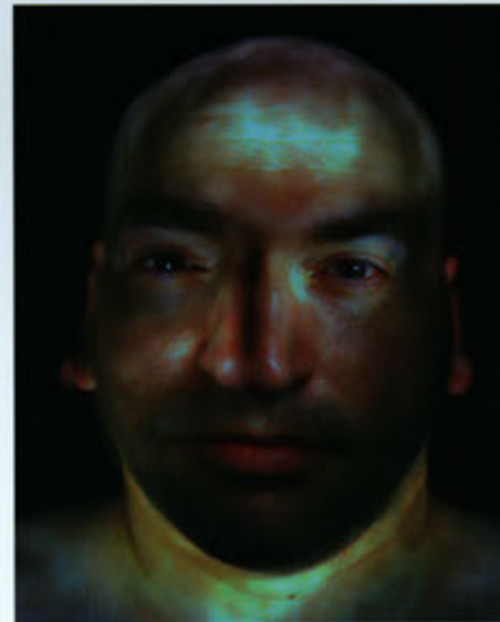
William, 2008 Pigmented ink on paper, 10 x 8"