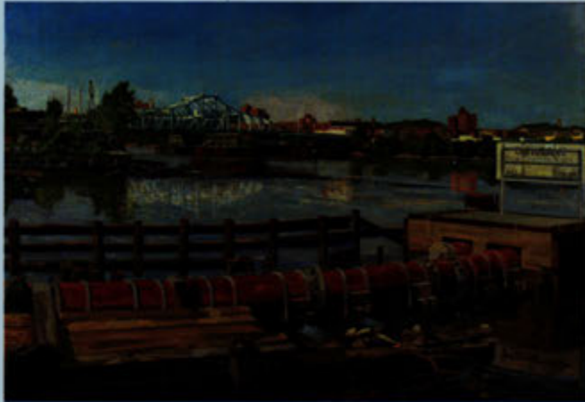
Across the Harlem River, 2008 Oil on linen, 25 x 36"