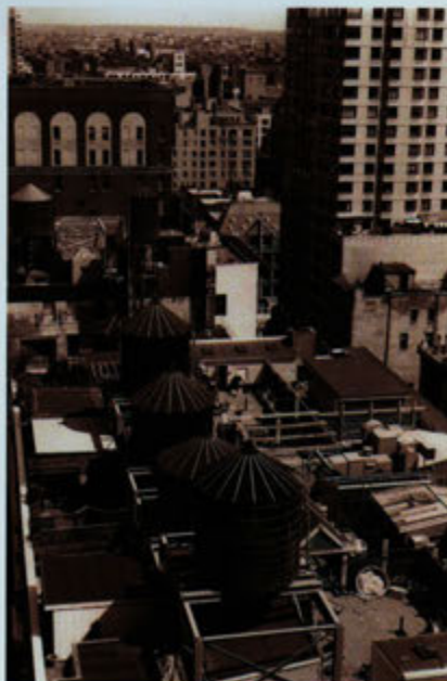
Big Brothers, Little Sisters , 2010 Aquatint etching, 13 x 8½"

Professor and Undergraduate Program Director Printmaking