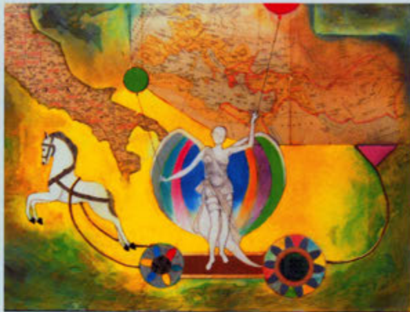
Nike Chariot , 2010 Drawing, collage, and mixed media, 27 x 21"