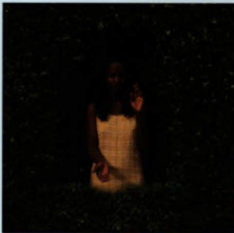
Iconography, untitled print no. 10 , 2010 Archival ink-jet print, 12 x 23"

Associate Professor, MFA Graduate Program Director, and Co-Director Digital Arts Minor Digital Media, Photography, and Video