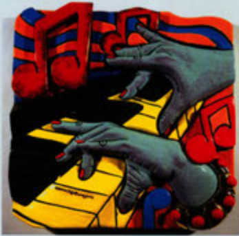
Times Square Times: 35 Times , 2005; Piano Hands © 2005 Toby Buonagurio

Professor Ceramics, Ceramic Sculpture, Painting and Drawing