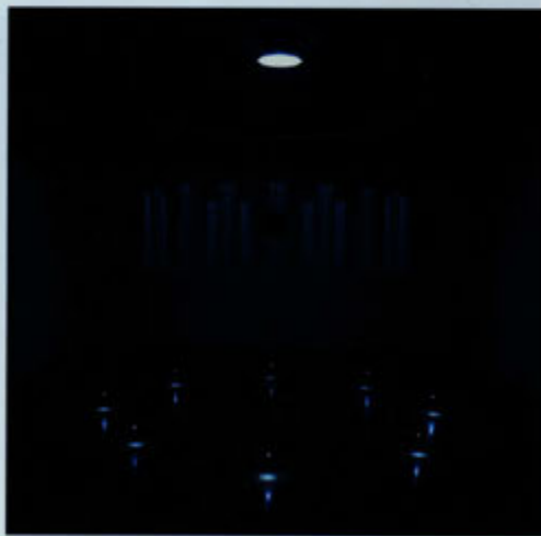
decipher , 2009-2010 Sound and light installation, dimensions variable, current installation 12 x 9 x 9' Original installation at the Second Street Gallery, Charlottesville, VA

Adjunct Lecturer Digital Media and Sound