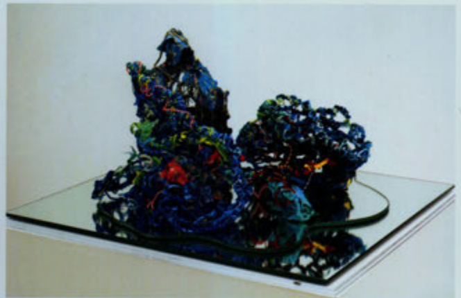
Sing City , 2009 Sculpture, 12 x 20 x 22"

Assistant to the Director, Pollock-Krasner House and Study Center, East Hampton, NY Painting and Sculpture