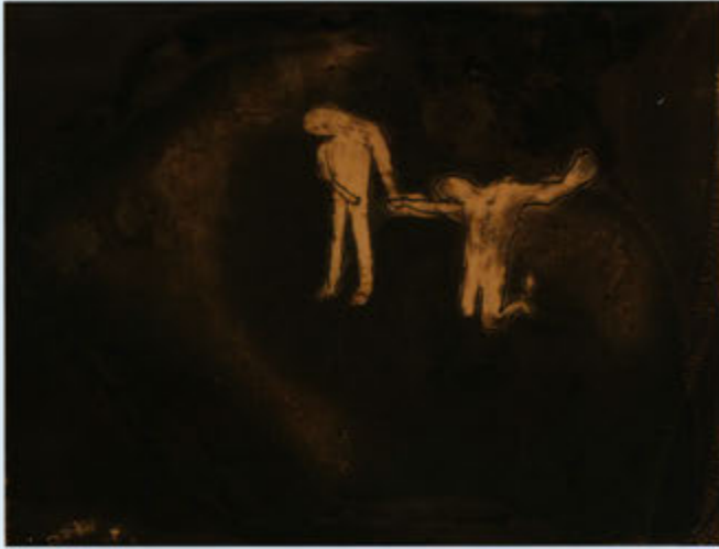
Untitled from the series Entangled with Justice, 2009 Unique, toned Polaroid Type 55 negative, 3¼ x 4¾"